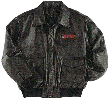
(brown or black)

This month, the Commander-in-Chief is issuing a challenge to all VFW members to get out there and tell eligible veterans about Life Membership and the Life Membership Installment Plan. Increasing our number of Life Members helps the VFW achieve our mission and maintain membership strength, and the Installment Plan provides an affordable way to make a member for life.